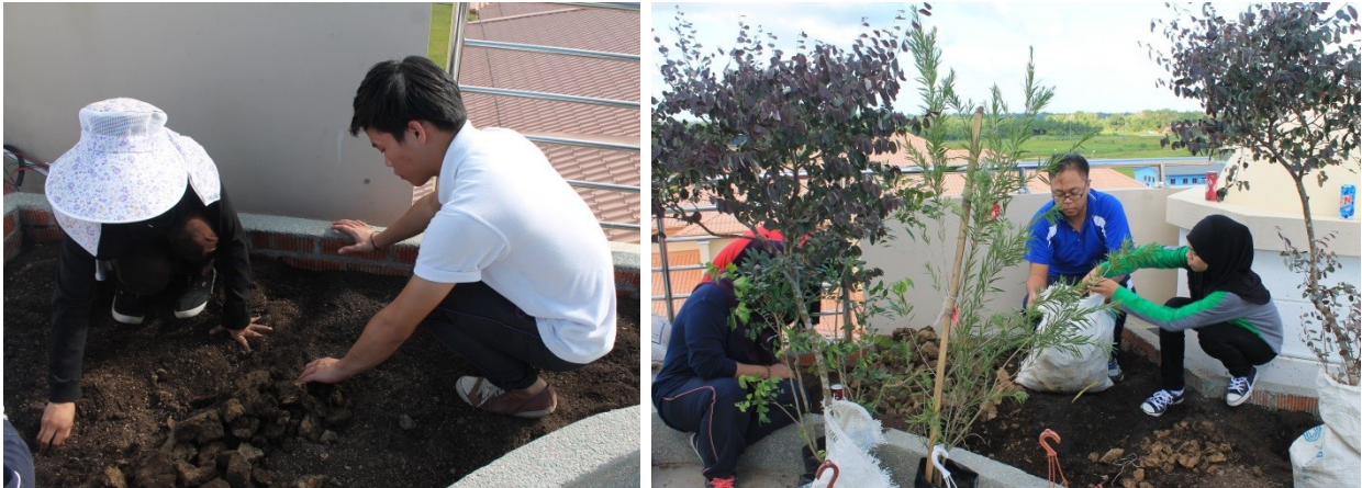
Figure 3: Soil medium preparation and transplanting plants for planter boxes