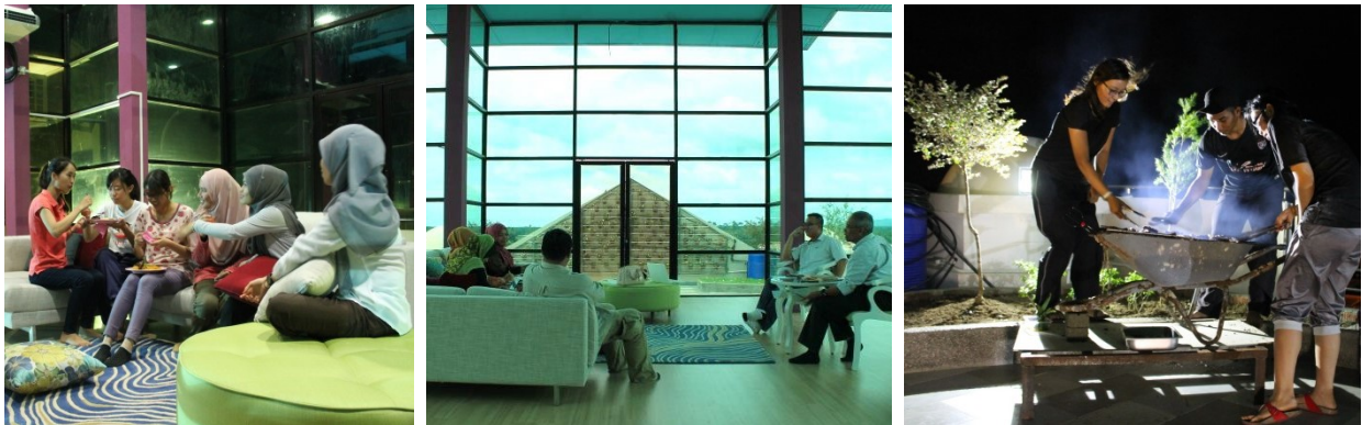
Figure 5: Rooftop garden for leisure and formal activities