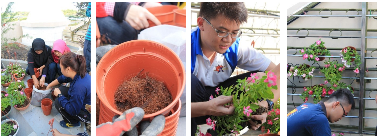
Figure 4: Transplanting ornamental plants for vertical garden system