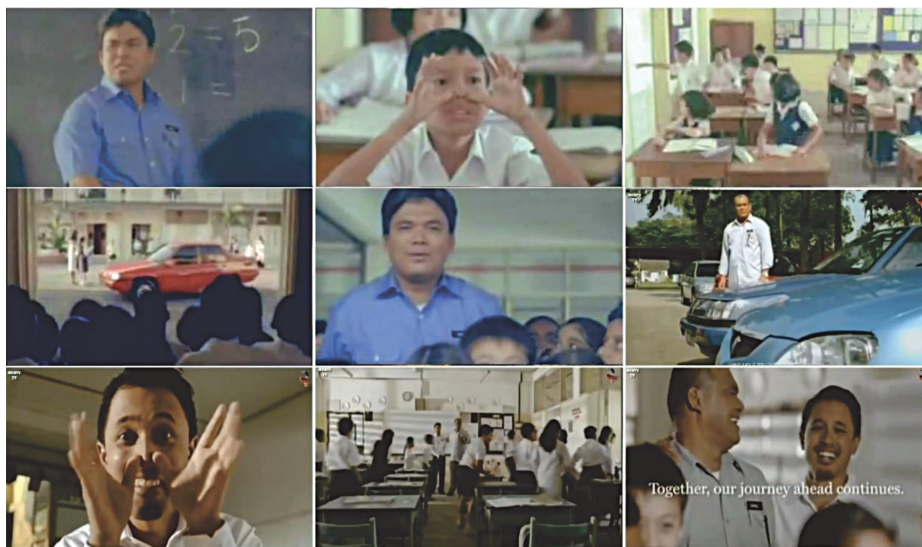
Figure 5 Screenshots of “PROTON _ Most Heartfelt Independence Day” (2006)