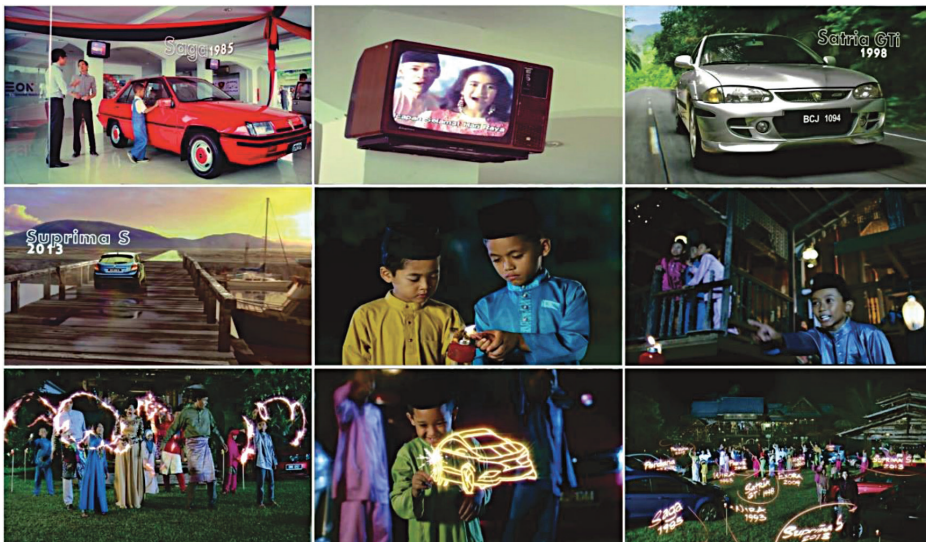
Figure 1 Screenshots of “PROTON Sepanjang Raya” (2014)