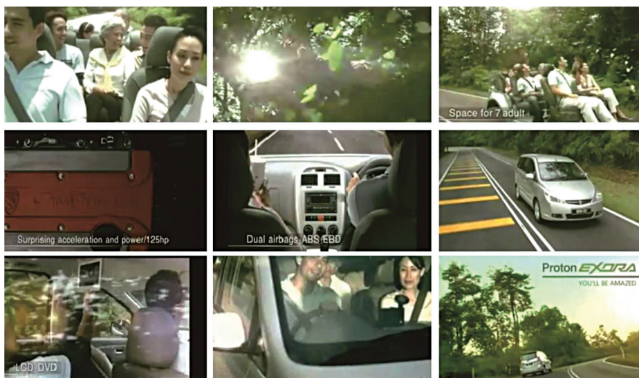
Figure 3 Screenshots of “PROTON Exora” (2009)