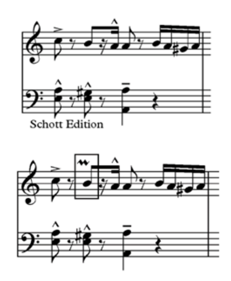
Figure 1 Added mordent in bar 8 in comparison with the published score

The musical analysis shows sample of excerpts of Say's embellishments. He added a mordent at bar 14. It is on a dominant chord. Figure 1 shows the added mordent on bar 14 in comparison with the published score.