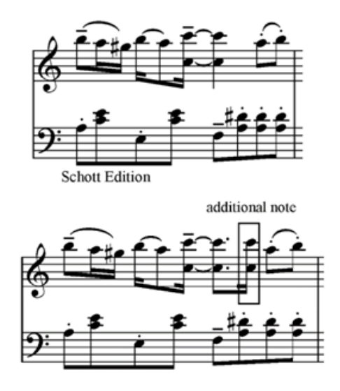
Figure 3 Added a syncopation note in bar 14

There are two added embellishments by Fazil Say in his performances; (1) ornamentations and (2) rhythmic extension. Say applies mordent ornamentation. According to the book Essay on the True Art of Playing Keyboard Instruments by Carl Phillip Emmanuel Bach, a mordent role is connecting from a note to another. It is added to "fill the sustained tones". Too many of mordent will destruct composer's work (Bach, 1974). The tremolo effects are to produce a highlighted tone. As in jazz music, it is commonly used in most of piano works. An octave of C note is added as rhythmic extension to emphasis the syncopated effects.