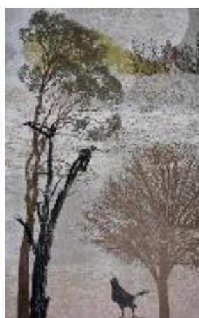
Figure 2. Vitness, linocut – unique, H)78.5cm x W)50cm, Dianne Fogwell, 2020.