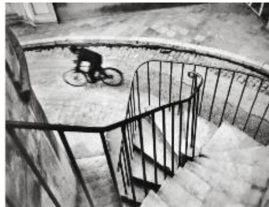
Figure 9. Hyeres, France, Bresson, 1932/c.1980, Gelatin silver, 30.5 × 45.2 cm.