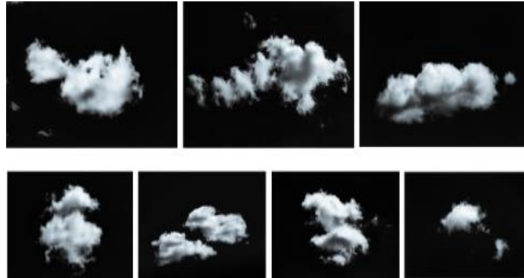
Figure7. Transient (1-7), Photography: Digital C-Type Photography, Sandra Jordan, H 36 cm x W 55 cm x D 2 cm, Sandra Jordan.

Jordan’s subject in her photographs, “Transient Series,” (see Fig 7) is a group of ever-changing white clouds, a series of works in which the artist captures clouds in various forms at different moments in time, each one a transient rendering of a cloud at a particular moment in time. Each piece in the whole group is a different moment in time, and presenting them in the same plane shows a transient landscape of different moments. The background of the piece is a serene black, and the main constituent element- dynamic, blooming white clouds, presents a transient nature by taking on different poses and forming a dynamic relationship with the background. The rhythmic balance of the image is made up of one static and one movement, giving off an extremely calming aura.