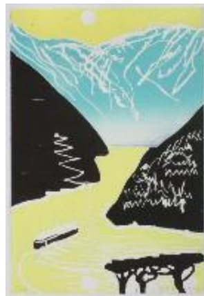
Figure 6. Transient Series - Pines Under Moon Ev3, Sadie Tierney, 2019.

Tierney, whose expressive prints are drawn from sketches and paintings that have been made outdoors, is characterized by her spontaneous use of color and line, exploring objects and landscapes where the form is associated with emotion and metaphor. Her work “Sadie Tierney - Transient Series - Pines Under Moon EV3” (see Fig 6) depicts literary poetry: “As the sun goes down, a mooring slowly pulls out of the harbor, the lights of the ship glowing as they reflect off the surface of the sea. A mountain like a sapphire peak nestled behind a sea lit by moonlight stood warm and serene. The ship in slow motion glimpses a new horizon at the turn of a high mountain valley in the road ahead, and the joy of the voyage’s imminent arrival radiates from the image.” (wang, 2019)