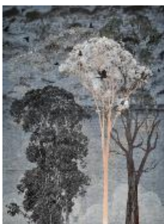
Figure 1. Lullaby, linocut & woodcut (unique), H)109 x W)79cm, Dianne Fogwell, 2020. Source: https://www.diannefogwell.com.au/exhibitions-archive/transient

"Elements carved in oil or wood come together as part of a larger story- some things stay, others disappear and reappear. I try to capture the idea that all things pass and that nature is capable and adaptable, able to regenerate into something beautiful and different." (Fogwell, 2020); Fogwell presents a series of works on the Australian landscape in her solo exhibition "Transient in Melbourne" (see Fig1,2,3).