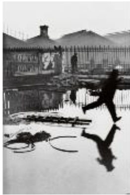
Figure 8. Behind the Gare Saint-Lazare, Bresson, 1932, Silver Gelatin Print, 44.5 × 29.7 cm.

Source: https://www.artsy.net/artwork/henri-cartier-bresson-behind-the-gare-saint-lazare