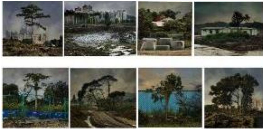
Figure 11. Transient Landscape, Archival Pigment print, 55 x 63 cm (Single), 2015.

In this group of works (see Fig 11), the artist, Heber, applies Archival pigment print for artistic expression. The human city is influenced by the development process of civilization, and the expression of the city is constantly changing, mapping the changes of the urban landscape in each state of time. The concept of time and place is reflected in this group of photographs, where time and place itself is the landscape, signifying the spirit of a certain moment or a certain era, and showing the constant presence of the spirit of the city at a particular time (Ono, 2015; Su, 2018). As time passes, times change and the spirit of society shifts, and the urban landscape changes. Thus, it is clear that everything is transient in existence (Han & Yin, 2019).