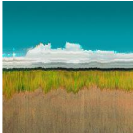
Figure 10. Transient landscape, photograph, Ansen Seale, Posted by Fabio 23, March 2010.

with plants of the opposite color (blue) it creates a contrast (Eren et al., 2022). The entire image creates a spatial link, from close up to a great distance because of the contrast between warm and cold tones.