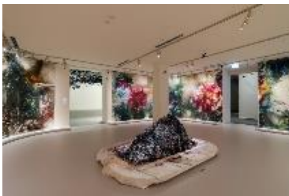
Figure 14. Transience I (Peony), 2019, Gunpowder on Porcelain, 90 cm x 100 cm x 200 cm, Cai Guoqiang, Commissioned by the National Gallery of Victoria.