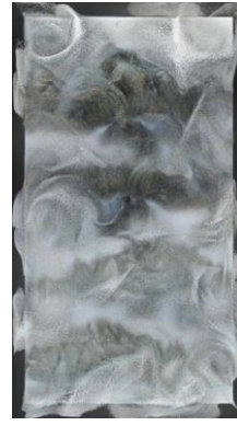
Figure 13. Artificial Intelligence Landscape Map.