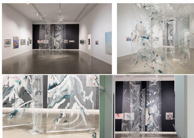
Figure 16. The Installation Art, Transient Horizons, Katya Roberts, 2013. Source: https://www.katyaroberts.com/transient-horizons-1