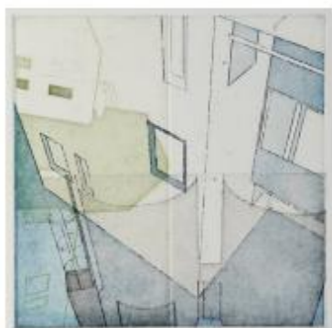
Figure 4. Transient Space, Aquatint on Paper, 30 W x 30 H x 0.1 D cm, Rowan Siddons, 2017. Source: https://www.saatchiart.com/art/Printmaking-Transient-Space-Limited-Edition-1-Of-1/833464/3945535/view