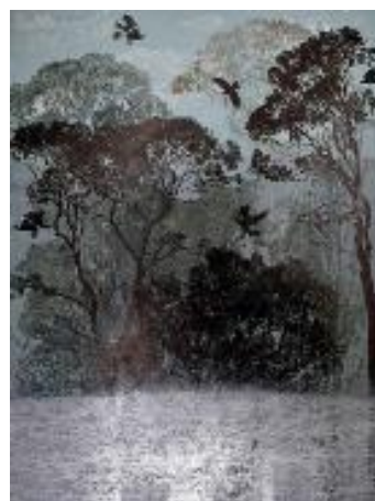
Figure 3. Half Light, linocut - pigmented ink – unique, H)109cm x W)79cm, Dianne Fogwell, 2020.

As Fogwell (2020) expressed, "A reflection on devastation and loss with a hope for a regeneration of place and soul, says the description of this show. These factors cause me to consider the power and fragility of the materials I employ and recognize the irony of creating pictures about the natural enemies of works on paper." A cloud of smoke and unburnt particles spread over Canberra is a ghostly signal of immense damage and disturbance. Fogwell's works and paintings on paper often resemble imaginary, almost hallucinatory dreams and create a story that flows between the works like pages of text or music. Fogwell's artistic process enhances the poetry of her work because she allows the image to emerge on paper rather than from a preconceived image. Her unique artist books and works on paper are created from multiple linocuts and sometimes layered woodcuts, demonstrating a special level of skill while showing her ongoing exploration of the print medium.