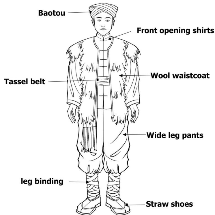
Figure 1. Naxi traditional men's clothing