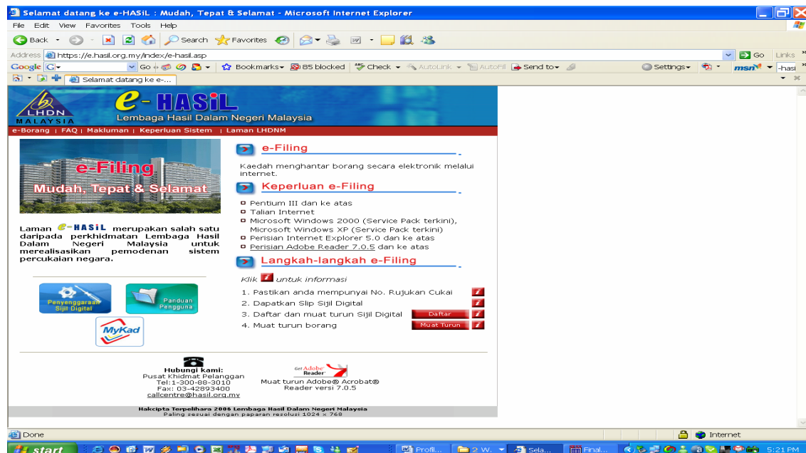
Figure 1: The e-Filing website

As you can see, e-government is one of the flagships that have been promoted by the government to enhance the services provided. Starting in 2006, Malaysian citizens are able to choose from two methods of tax-filing; manual and the Internet based or e-Filing. This is the first year the Inland Revenue Board (IRB) Malaysia introduced the use of online tax return filing. The web page for the e-Filing is presented in Figure 1 (IRB, 2008).