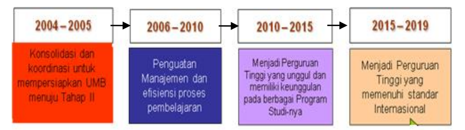
Figure 1: Stages of Development Master Plan (RIP) of UMB

values of work culture which satisfies consumers and users of the services of UMB graduates. Based on the researcher's observation, the rector shows transformational leadership in leading the university. The rector's work behaviors encourage the deans and lecturers to achieve the objectives they have set; care for their subordinates and pay attention to the feelings and needs of the subordinates (Providing individualized support); set example for the subordinates to be consistent with the leadership values (Providing an appropriate model); encourage the subordinates to always reconsider old assumptions and think of new ways to have optimal performance (Intellectual stimulation); reflect expectation for the subordinates to achieve high quality of work, perfection and performance (High performance expectation); identify new opportunities to develop the future organizational vision of university (Identifying and articulating a vision). The rector of UMB is very focused on the growth and development of UMB organization by setting 2004-2019 Strategic Plan or Development Master Plan (RIP) of UMB as shown in figure 1.