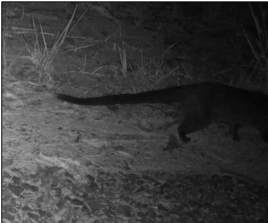
Common Palm Civet/ Musang Pulut (LC) ( Paradoxurus hermaphroditus )