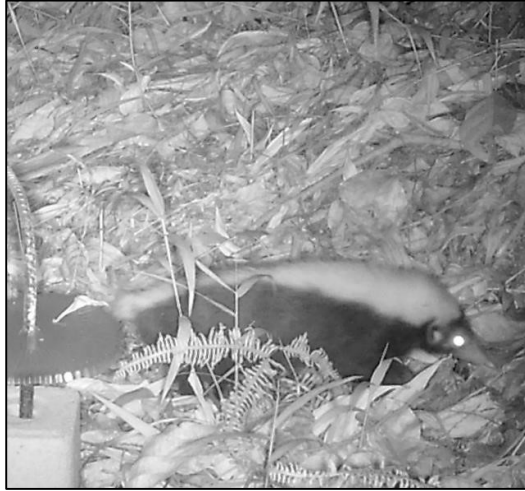
Sunda Stink-Badger/ Teledu (LC) ( Mydaus javanensis )