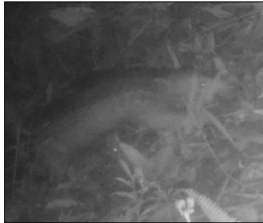
Sunda Pangolin/ Tenggiling (CR) ( Manis javanica )