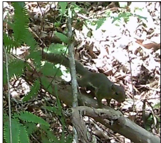
Plantain Squirrel/ Tupai Pinang (LC) ( Callosciurus notatus )