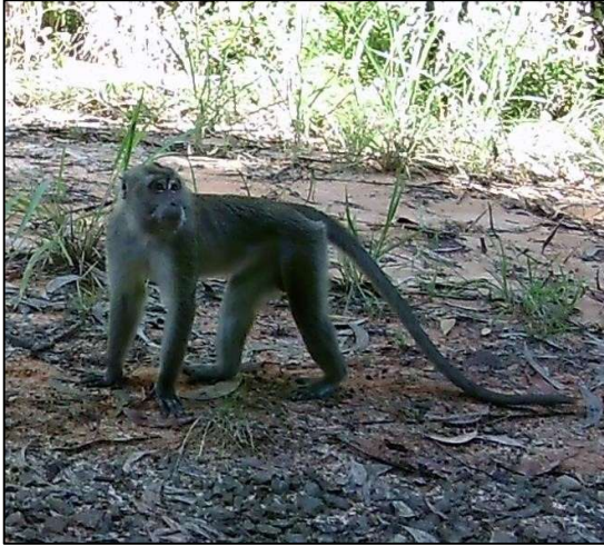
Long-tailed Macaque/ Kera (EN) ( Macaca fascicularis )