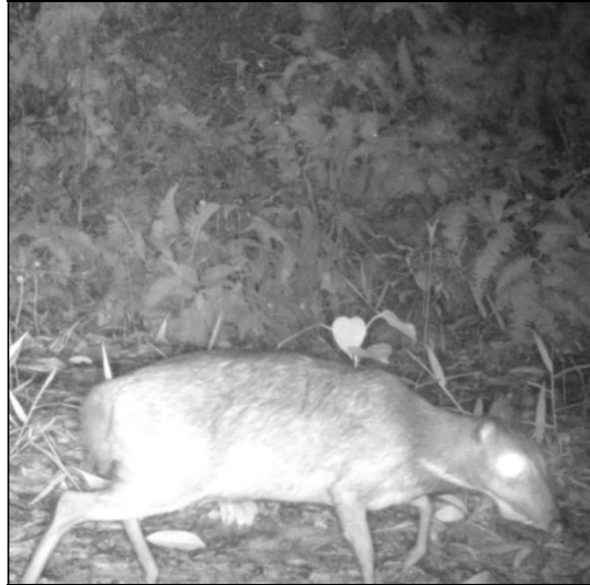
Mousedeer/ Pelanduk (LC) ( Tragulus spp. )