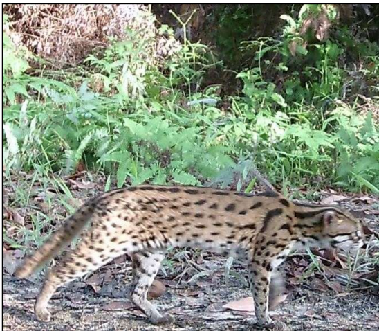
Leopard Cat/ Kucing Batu (LC) ( Prionailurus bengalensis )