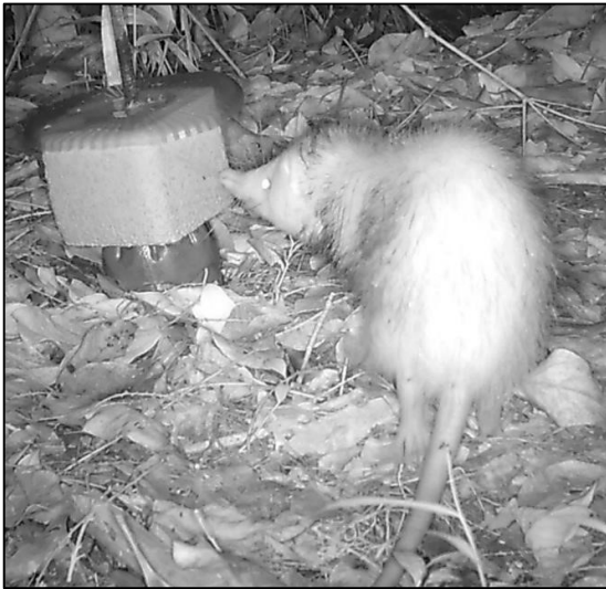
Moonrat / Tikus Ambang Bulan (LC) ( Echinosorex gymnure )