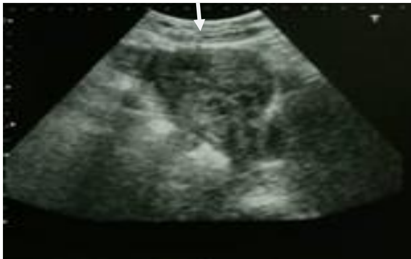
Figure 3 Three months of post myomectomy. Arrow indicates uterus approximately 9 × 4 cm

In 2013, it was noted asymptomatic small uterine fibroids which might be missed during previous laparotomy myomectomy, however, patient was not keen for any active management as her lifestyle was much improved after myomectomy where she experienced significant improvement of dysmenorrhea, no prolonged or heavy menstrual bleeding, no more hospital admissions for blood transfused, active and can do her duty until last review 2016. The patient has opted for conservative management as she would decide for her fertility workup after