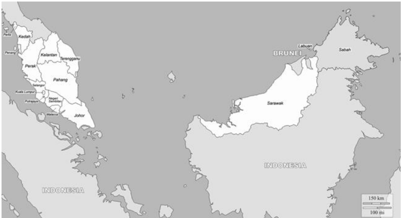
Figure 1: Locality of Sabah, Malaysia

Malaysia is located in South East Asia and therefore experiences equatorial climate with a mean temperature of 22 to 32 degrees Celsius. The average annual rainfall is 3,000 millimetres, seasonally distributed throughout the year. Generally, Malaysia experiences four monsoon seasons, influenced by the periodic changes in the wind flow. The Northeast Monsoon occurs from November until March. During this season, the east coast of Peninsula Malaysia, and some parts of western Sarawak and Sabah's northeast coast regions experience heavy rainfall. Two Inter-Monsoons March to May and October until mid-November bring in convectional rain. Whereas during the Southeast Monsoon around May or June ending in September causes relatively dry weather except for Sabah (Malaysian Meteorological Department, 2017). Sabah's specific rainfall patterns are discussed further in Section 0.