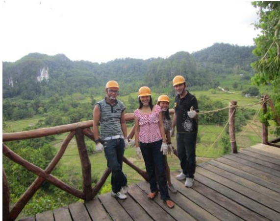
FIGURE 2. PPUR National Park Karst forest (background) and rice paddies (below) at Ugong Rock

At the top is a panoramic view deck (Figure 2), where one could enjoy sightseeing and taking pictures of the vast PPUR National Park karst forest and its surrounding rice paddies. There are two ways of going down from here, following the trail as one climbs up through caves or the zip line adventure. The two popular zips are sitting position and superman descend (Figure 3).