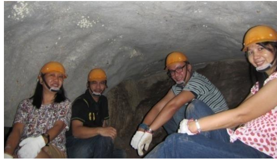
FIGURE 1. Smooth surfaces inside the cave at Ugong Rock, Tagabinet, Puerto Princesa City