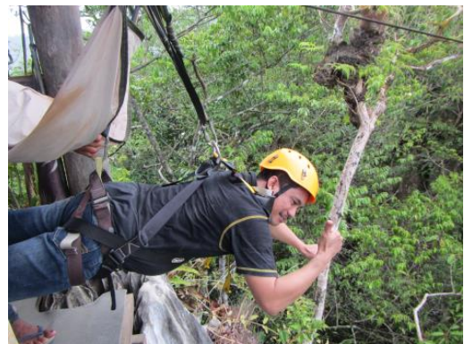
FIGURE 3. Preparing for a superman descend at Ugong Rock view deck