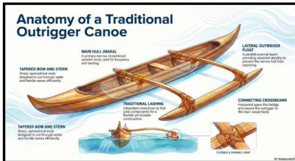
Figure 4: Anatomy of a Single-Outrigger Canoe