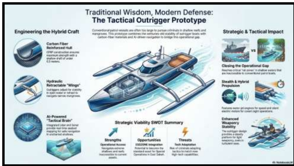
Figure 2: Prototype Modern Tactical Bot