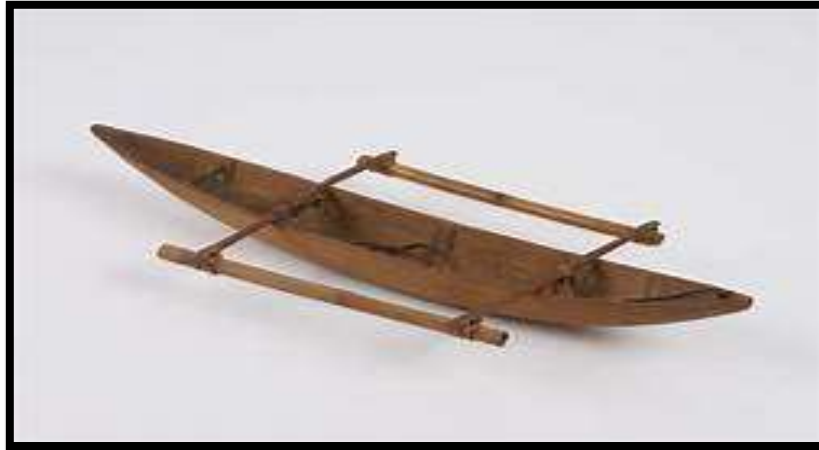
Figure 3: Illustration of a Double-Outrigger Boat

Sources: Horridge, A. (2015). The prahu: Traditional sailing boat of Indonesia . Oxford University Press. Also see Manguin, P. Y. (2012). Austronesian shipping encounters the Indian Ocean: The Ship Archaeology Record . Oxford Centre for Maritime Archaeology.