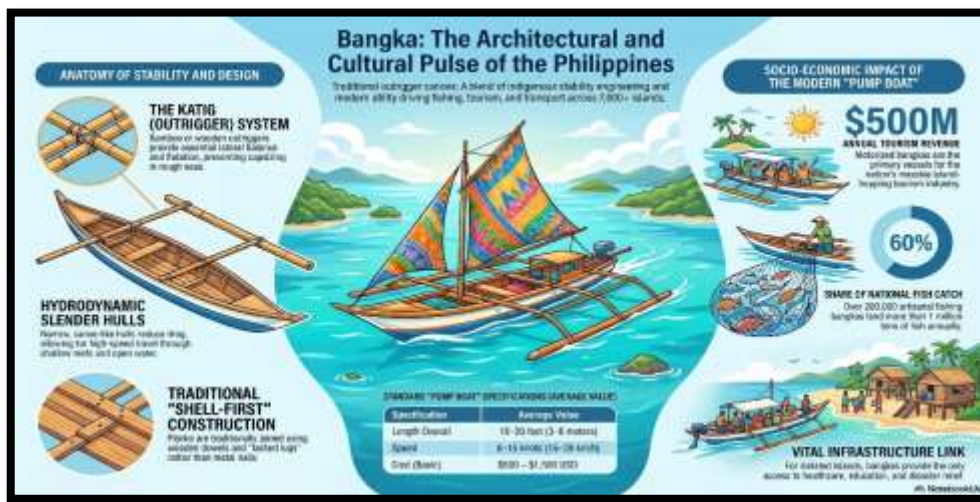
Figure 1: Illustration of the design of the outrigger boat Traditional

Source: Modified from Philippine Statistics Authority (PSA), Department of Tourism (DOT) Philippines and "Contribution of artisanal fisheries to Philippine economy", "Island hopping tourism impact Philippines" and Google. (2026). Bangka: The architectural and cultural pulse of the Philippines Image generated by AI. NotebookLM.