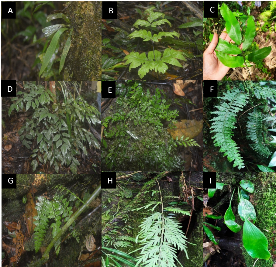
Figure 2. Some ferns and lycophytes: A.) Antrophyum callifolium Blume, B.) Tectaria sp. C.) Abacopteris nitida (Holttum) S.E.Fawc. & A.R.Sm., D.) Asplenium persicifolium J.Sm. ex Mett., E.) Bolbitis heteroclita (C.Presl) Ching, F.) Vandenboschia auriculata (Blume) Copel., G.) Leucostegia immersa (Wall.) C.Presl, H.) Selaginella involvens (Sw.) Spring, I.) Antrophyum plantagineum (Cav.) Kaulf.