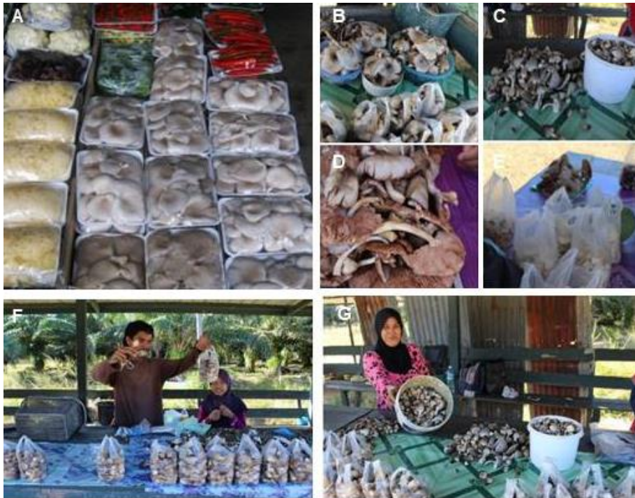
Figure 3. Local fresh wild mushroom market. A. Commercial edible mushrooms at Kudasang. B-D. Wild edible Volvariella volvacea . E. Pleurotus djamor djamor and Marasmiellus sp. F-G. Wild mushrooms sold at Kota Marudu along the way to Serinsim by roadside.

were found on the empty fruit branches of palm kernel. Oil palm plantations are a preferred habitat for these three edible mushroom species ( Volvariella volvacea , Pleurotus djamor , and Marasmiellus species). Both Marasmiellus sp. is collected together with Pleurotus djamor var. djamor (known as Kulat Tiram ). Termitomyces eurhizus (Termite-fungus, locally known as Tamburong ) was also collected from oil palm plantations where most of the area was covered with termite mounts. The plantation workers collect and sell the wild Termitomyces occasionally during the rainy season.