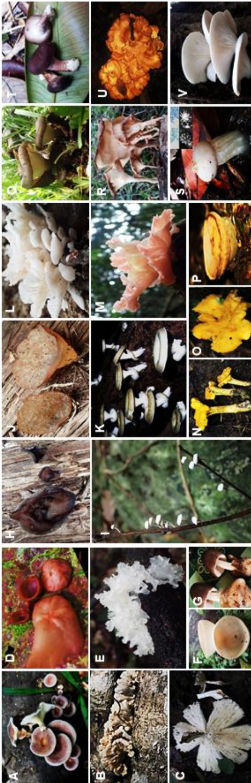
Figure 2. Wild edible mushrooms. A. Panus lecomtei . B. Schizophyllum commune . C. Termitomyces eurrhizus . D. Auricularia sp. E. Tramella fuciformis . F. Cookeina sulcipe . G. Volvariella volvacea . H. Auricularia sp. I. Marasmiellus sp. J. Auricularia sp. K. Lentinus sajor-caju . L. Pleurotus djamar var. djamar . M. Pleurotus djamar var. roseus . N-O. Chanterellus cerinoalbus . P. Gaiella rufa . Q. Pleurotus giganteus . R. Pleurotus tuber-regium . S. Calostoma insignis . T. Lentinula edodes (wild Borneo shitake). U. Pleurotus tuber-regium . V. Pleurotus pulmonarius .