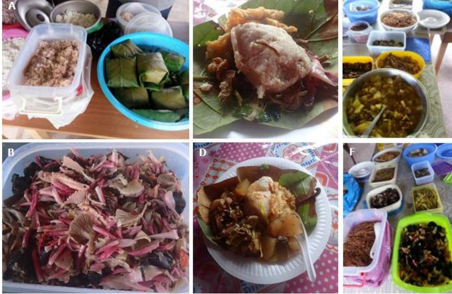
Figure 4. Indigenous delicacies of wild edible mushrooms in Sabah. A. Linopot contains hill rice wrapped with banana leaf. B. Pleurotus djamor djamor fried with barking deer ( kijang ) meat and wild ginger flower ( Bunga Kantan ). C-D. Schizophyllum commune fried with vegetables and chicken. E-F. Wild mushrooms culinary serve at festival or on any auspicious day.

( Kulat Ubi ) were the common wild edible mushrooms in their soups that are used to treat cold and fever.