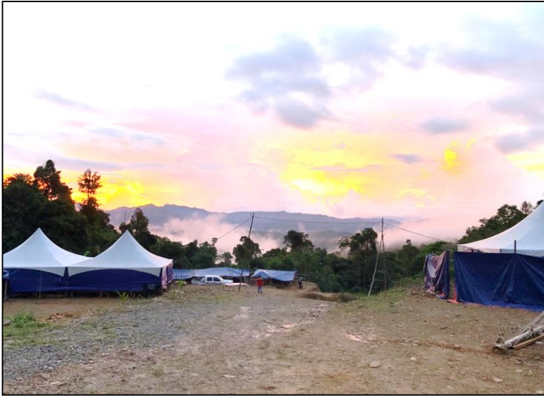
Figure 2. Basecamp site at Podos Heritage Homestay, Kg. Podos