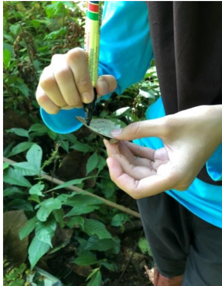
Figure 3. Catch, mark and release technique

In order to reduce the number of butterflies killed, individuals that could be identified in the field were marked and released. The butterflies were marked with a marker pen at the underside of their wings before they were released (Figure 3). For each of the species sampled and identified in the field, three or fewer individuals were taken as specimens.