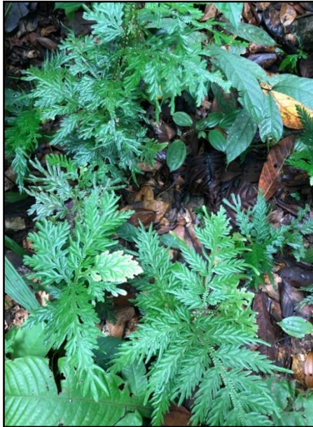
Figure 5. Selaginella spp. at the study area

protected species under CITES (CITES, 2013) or least concern by IUCN (Malaysia Biodiversity Information System, 2020). This remarkable species is also known as Rajah Brooke's Birdwing and frequents habitats with streams. Phon et al. (2018) reported this species is facing heavy commercial exploitation and habitat loss: between 2001 and 2010, the total reported export trade of wild specimens was 5,060 individuals.