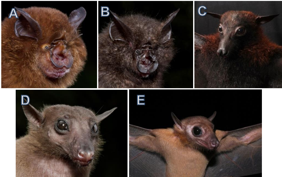
Figure 2. Photo of A Rhinolophus borneensis , B Rhinolophus sedulus , C Pteropus vampyrus , D Eonycteris major , and E Rousettus amplexicaudatus