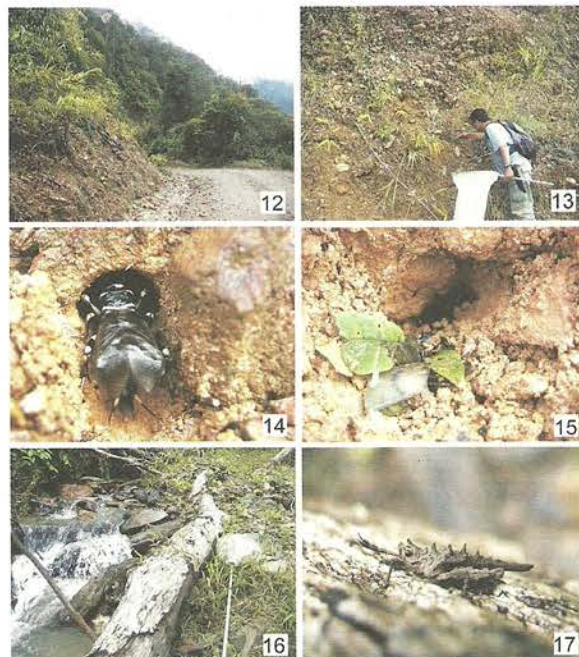
Figs. 12-17. The habitats of the lowland forest and species found there: 12, Site D (1200m), 13, the 2nd author excavating a nest of Gymnogryllus borneensis ; 14, male of G. borneensis , singing at the entrance of its gallery; 15, leaves preserved in the deepest part of the gallery of G. borneensis ; 16, Site E (800-1000m); 17, Discotettix belzebth .